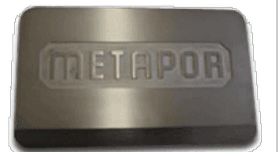
Thermoforming without venting, tracking, or backdrilling