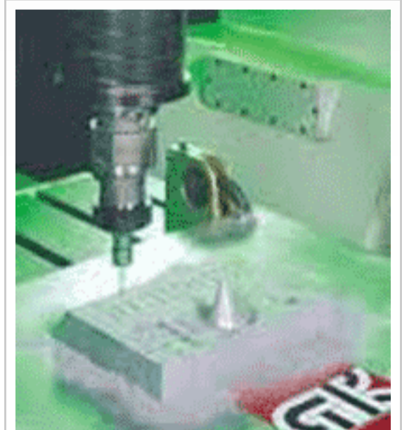
Cuts faster than standard aluminum